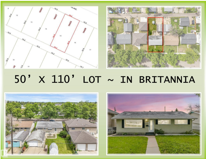
50' X 110' LOT ~ IN BRITANNIA